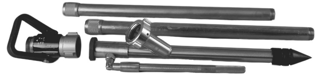
904 - without shutoff valve 904K - with shutoff valve