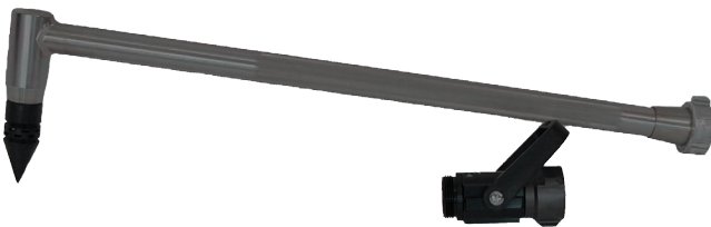
906 - without shutoff valve 906K - with shutoff valve